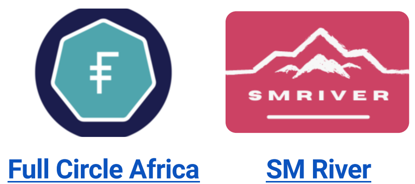
Full Circle Africa